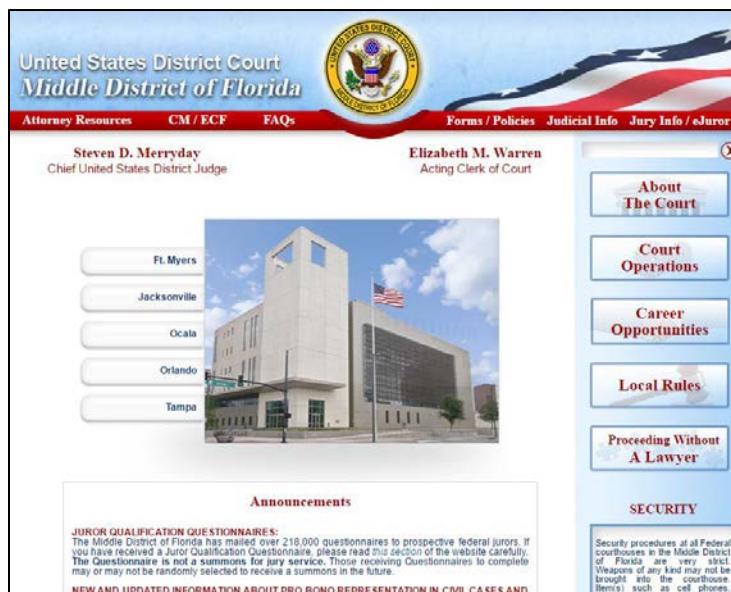
Figure 1 – Web Site of the U.S. District Court for the Middle District of Florida, https://www.flmd.uscourts.gov/

to opinions at many district court web sites. Figure 1 shows the home page of the Middle District of Florida site. Behind what door (tab or link) would a non-expert expect to find its opinions?